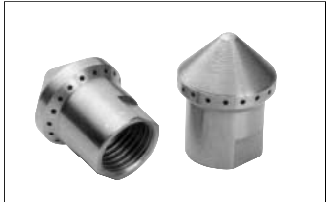
The picture shows dispersion nozzles with exhaust hole angles of 90° and 135°.

Meets OSHA safety regulations. Patented.